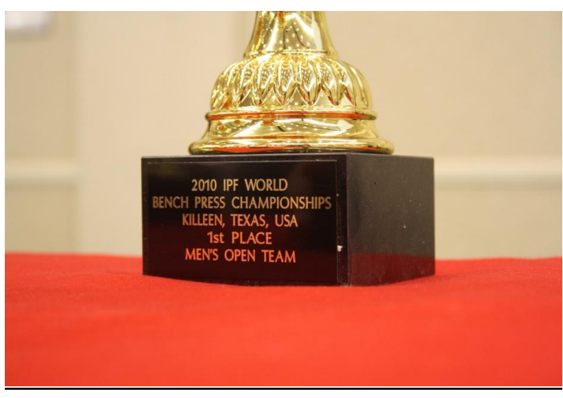
Men's Open Team Trophy

The World Bench Press Championship started in a small town with 236 lifters from 30 different country's near Austin in Texas, the town of Fort Wood, Killeen. A town with one of the biggest army bases in the USA, as they got 50 000 army personnel. The weather was nice and warm with the occasional WARM wind blowing throughout the day, but hey, this is Texas! Altogether there were 41 continental and world records broken, just as it should be!